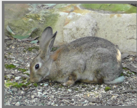
European rabbit ( Oryctolagus cuniculus ) with tail up