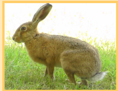
European hare ( Lepus europaeus ) with tail down